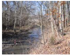
These efforts will help protect our natural resources for future generations.

WHAT IS STORMWATER AND WHY SHOULD WE CARE? Similar to sanitary sewer services, the City operates and maintains a system of pipes and channels that drains and protects our homes and businesses from flooding. This drainage system is costly to operate and maintain, and it is facing increasing regulatory requirements from the EPA.