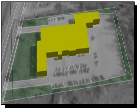
Measured impervious surfaces are the basis for charging non-residential customers. Residential properties are charged a flat rate.

This user fee approach is the fair and equitable standard used across the country. For example, if a corner restaurant has four times the impervious area of a residential property, then it pays four times the user fee.